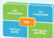
Image & Quantify

Automated Western Blotting device completing the entire process of blocking, antibody incubation and washing steps.