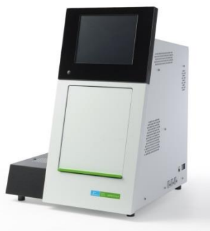
LabChip GX Touch

JANUS G3 NGS Express • Bench-top Sequencer Sample Preparation